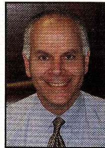
Urso TDI Group LLC